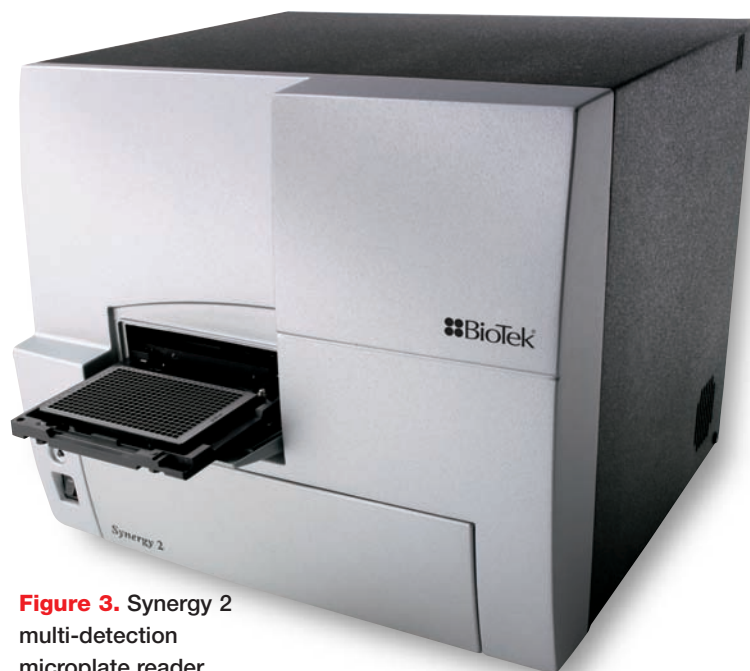
Figure 3. Synergy 2 multi-detection microplate reader.

be utilized in the process. Finally, FP results are resistant to variations from detection instruments.